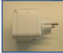
Foto del artículo Picture of the item

El objeto descrito se ajusta a la legislación pertinente de armonización de la Unión: