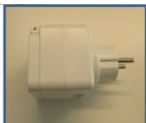
Bild av artikeln Picture of the item

Det beskrivna objektet överensstämmer med relevant EU-harmoniseringslagstiftning: The described object of the declaration is in conformity with the relevant Union harmonisation legislation: