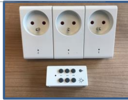
Foto del prodotto Picture of the item

L'oggetto descritto è conforme alla pertinente normativa di armonizzazione dell'Unione: The described object of the declaration is in conformity with the relevant Union harmonisation legislation: