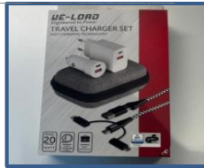
Foto del prodotto Picture of the item

L'oggetto descritto è conforme alla pertinente normativa di armonizzazione dell'Unione: The described object of the declaration is in conformity with the relevant Union harmonisation legislation: