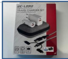
Foto do artigo Picture of the item

O objeto descrito está em conformidade com a legislação de harmonização pertinente da União: