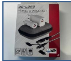
Foto a articolului Picture of the item

Obiectul descris este în conformitate cu legislația relevantă de armonizare a Uniunii: The described object of the declaration is in conformity with the relevant Union harmonisation legislation: