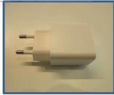
Foto del artículo Picture of the item

El objeto descrito se ajusta a la legislación pertinente de armonización de la Unión: