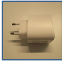
Image de l'article. Sample picture of the item.

L'objet décrit est conforme à la législation d'harmonisation de l'Union pertinente: The described object of the declaration is in conformity with the relevant Union harmonisation legislation: