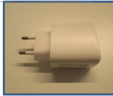
Foto del artículo Picture of the item

El objeto descrito se ajusta a la legislación pertinente de armonización de la Unión: