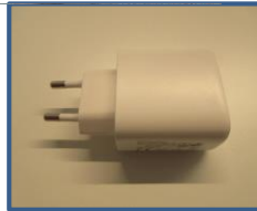
Foto del prodotto Picture of the item

L'oggetto descritto è conforme alla pertinente normativa di armonizzazione dell'Unione: