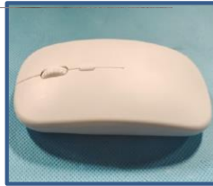
Foto a articolului Picture of the item

Obiectul descris este în conformitate cu legislația relevantă de armonizare a Uniunii: The described object of the declaration is in conformity with the relevant Union harmonisation legislation: