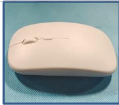
Foto članka Picture of the item

Opisani objekt je u skladu s odgovarajućim zakonodavstvom harmonizacije Unije: The described object of the declaration is in conformity with the relevant Union harmonisation legislation: