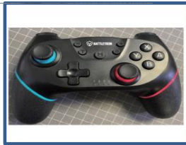
Foto del prodotto Picture of the item

L'oggetto descritto è conforme alla pertinente normativa di armonizzazione dell'Unione: