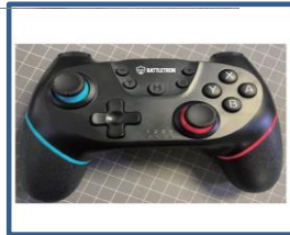
Foto do artigo Picture of the item

O objeto descrito está em conformidade com a legislação de harmonização pertinente da União: The described object of the declaration is in conformity with the relevant Union harmonisation legislation: