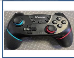
Foto del artículo Picture of the item

El objeto descrito se ajusta a la legislación pertinente de armonización de la Unión: The described object of the declaration is in conformity with the relevant Union harmonisation legislation: