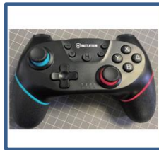
Image de l'article. Sample picture of the item.

L'objet décrit est conforme à la législation d'harmonisation de l'Union pertinente: The described object of the declaration is in conformity with the relevant Union harmonisation legislation: